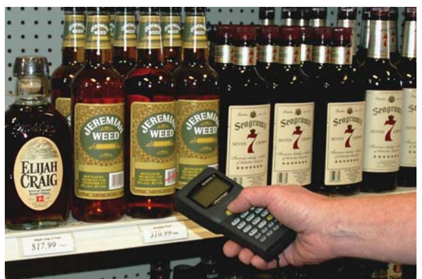
SAM2000 accepts inventory receipts and inventory updates from popular handheld portable data terminals.