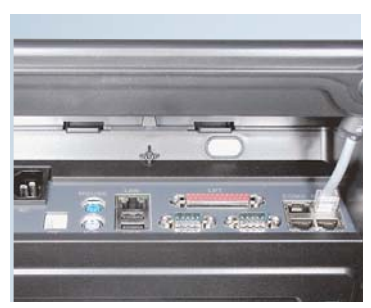
Easy to Access Ports Connect to a wide array of compatible off-the-shelf POS peripherals with six serial ports and two USB ports.

Easy Save/Load Store programs or collect reports with the SD memory card port or USB port.