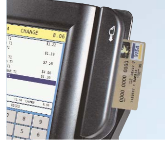
Magnetic Card Reader Use to swipe payment cards when integrated payment options are implemented, or to log or clock in employees.

Rear Display The rear display allows consumers to monitor prices as items are entered and view the sale total.