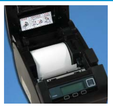
Drop and Print Paper Loading - Optional Paper Width Selector Allows 58mm Wide Paper Rolls