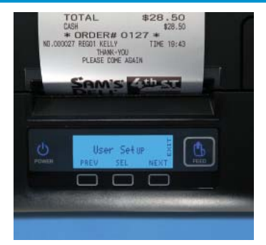
Liquid Crystal Display Guides the Operator Through Setup and Option Selections