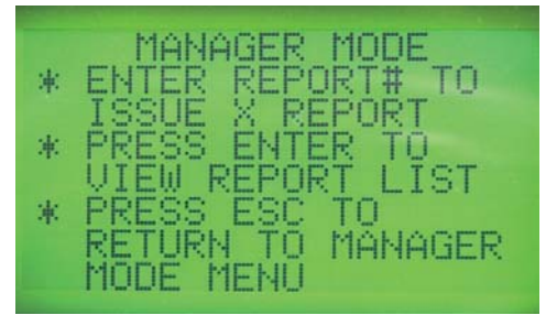
Easy-to-Follow Messages Guide Your Operators with Minimal Training