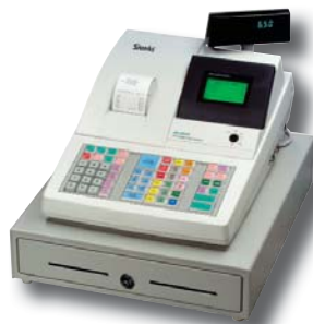
ER-650R Raised-Key Keyboard; Thermal Receipt Printer