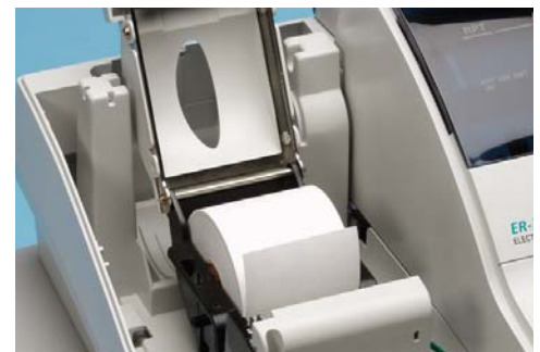
Quick and Easy Drop-in Paper Loading (ER-650, ER-650R)