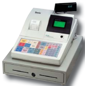
ER-650 Flat, Spill-Resistant Keyboard; Thermal Receipt Printer