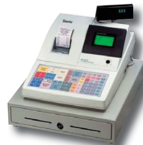
ER-655II Flat, Spill-Resistant Keyboard; Dot-Matrix Receipt Printer