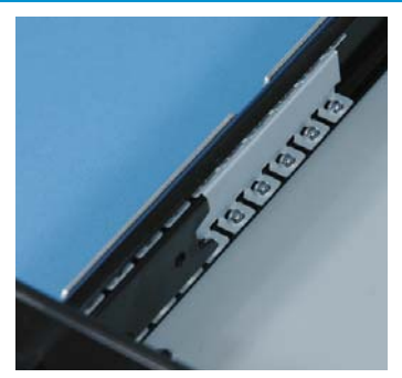
Drawer Glides Effortlessly on Side Rails with 24 Steel Ball Bearings per Rail