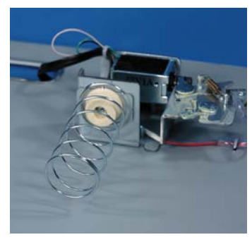
Heavy Duty 2-Stage Latch Mechanism