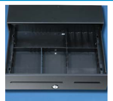
Configure the Storage Area to Your Needs Using the Adjustable Partitions Provided