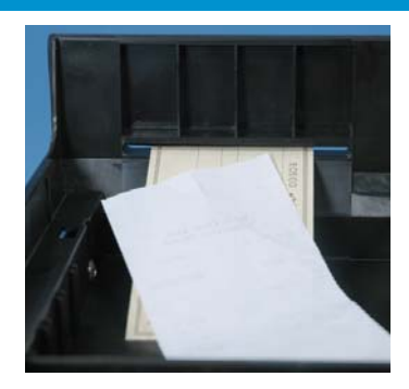
Checks and Card Slips Can be Inserted Into the Media Slots without Opening the Drawer