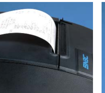
Liquid Guard Built Into the Cabinet Design