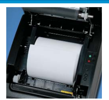
Drop and Print Paper Loading