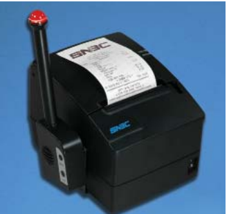
Optional Audio/Visual Print Messenaer