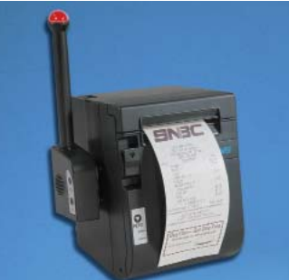
Optional Audio/Visual Print Messenaer