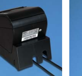
Optional Power Supply Cover with Cable Management Slots