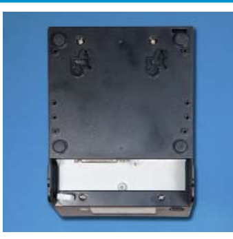
Built-In Wall Mount Capability