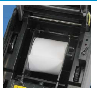
Drop and Print Paper Loading with an Adjustable Paper Width Selector