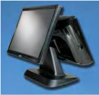
Optional Integrated 15" Rear LCD Customer Display (NCC Reflection POS for Windows)