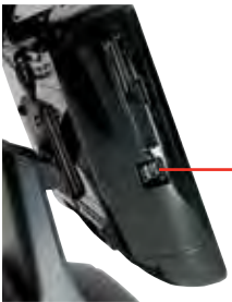
Plus Two USB Ports on the Left Side of Monitor