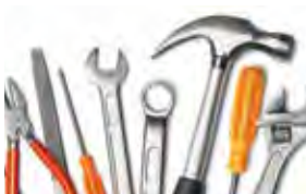
Hardware, Paint or General Retail Stores