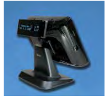
Optional Integrated Rear VFD Customer Display