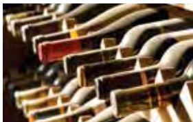
Tobacco / Wine / Small Grocery Stores