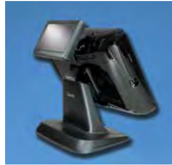
Optional Integrated 7" Rear LCD Customer Display (NCC Reflection POS for Windows)