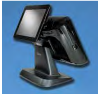
Optional Integrated 9.7" Rear LCD Customer Display (NCC Reflection POS for Windows)