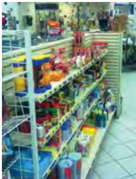
Convenience Stores / Dollar Stores / Gift Shops