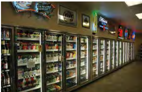
Beer / Liquor Stores