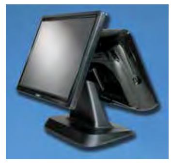
Optional Integrated 15" Rear LCD Customer Display (NCC Reflection POS for Windows)