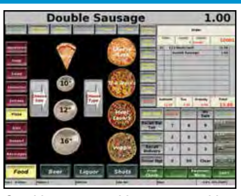
Graphic screens guide operators with minimal training.

The NCC Reflection POS delivery module will allow guest checks to be created and assigned to customers for delivery. NCC Reflection POS can maintain a customer file of 9,999 entries which can be accessed and sorted by customer ID number, phone number, address, first and last name or by city. NCC Reflection POS can create and store new customers on the fly during a first time purchase. When used with PC WorkStation NCC Reflection, POS can automatically retrieve order history allowing for fast and accurate order entry. Guest checks created for delivery are