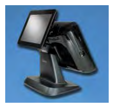
Optional Integrated 9.7" Rear LCD Customer Display (NCC Reflection POS for Windows)