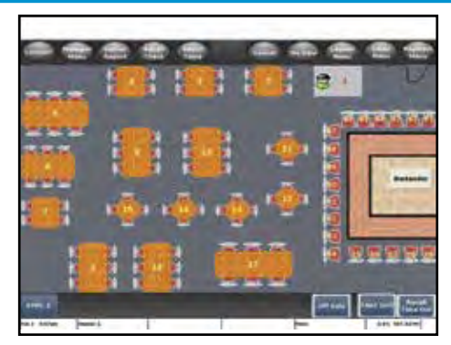
Customized graphical table maps.