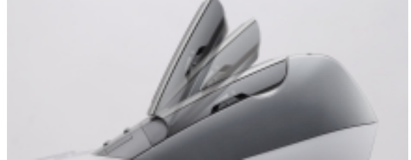
• The LCD display can be tilted to the optimal reading angle.