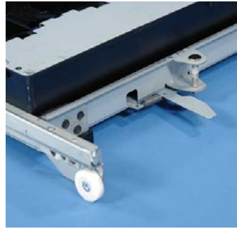
Steel Side Rails with Heavy Duty Nylon Rollers