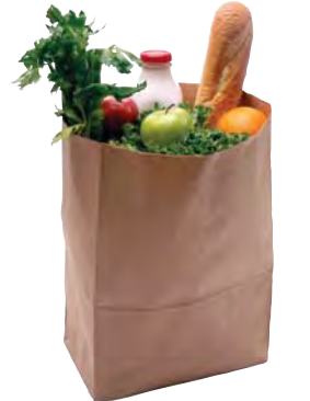
Convenience Stores / Small Grocery Stores