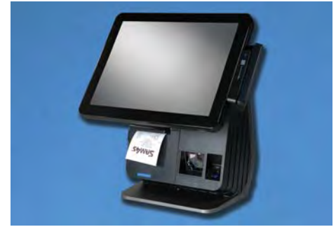
Card Reader / Printer / Scanner + Fingerprint Reader