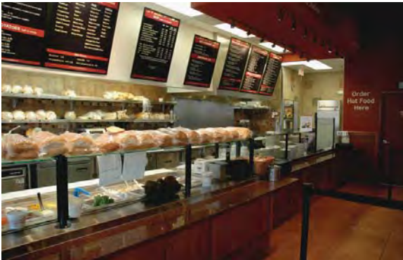
Cafeterias / Quick Service Restaurants