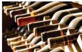
Tobacco Stores / Bars / Liquor Stores