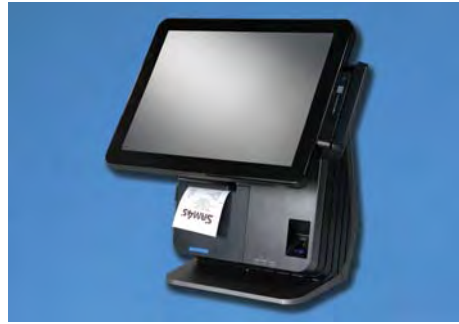
Card Reader / Printer / Fingerprint Reader