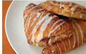
Dusty Environments Like Pizza and Bakeries