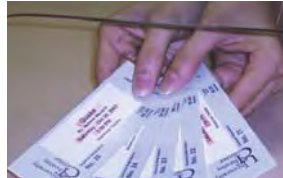
Theater Concessions / Ticket Booths / Box Offices