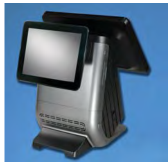
Optional Integrated 9.7" LCD Customer Display