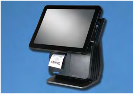
Card Reader / Printer