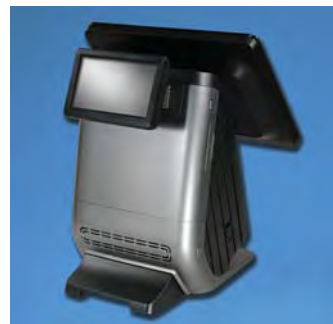
Optional Integrated 7" LCD Customer Display