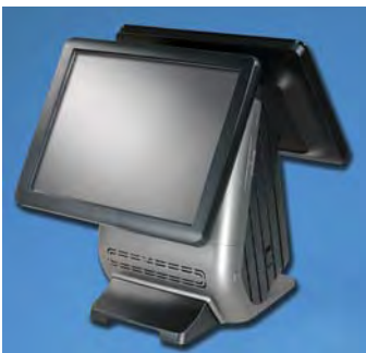
Optional Integrated 15" LCD Customer Display