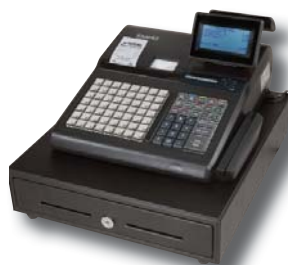
SPS-345 Raised-Key Keyboard (Expanded); Receipt And Journal Printers