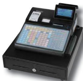
SPS-340 Flat Spill-Resistant Keyboard; Receipt And Journal Printers