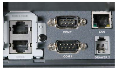
Up to 4 RS-232C Ports Hidden Behind a Convenient, Easy to Access Door