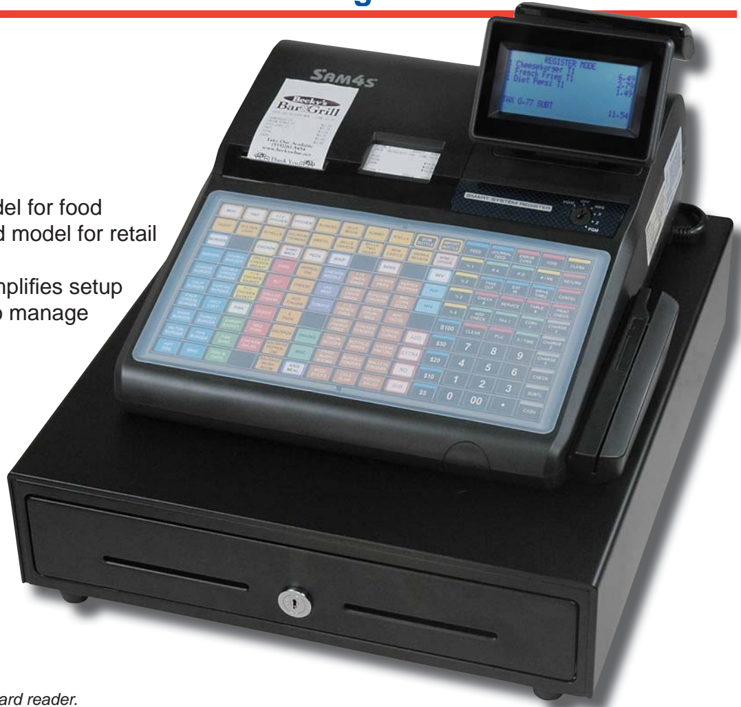
SAM4s SPS-340 shown with optional card reader.