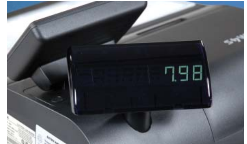
9-Digit LED Customer Turret Display