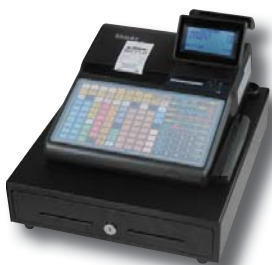
SPS-320 Flat Spill-Resistant Keyboard; Receipt Printer