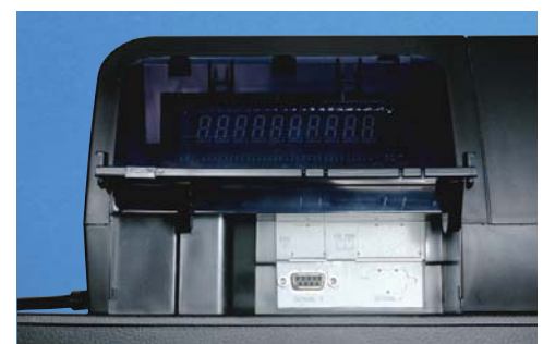
One Standard RS-232C Port Hidden Behind a Convenient, Easy to Access Door