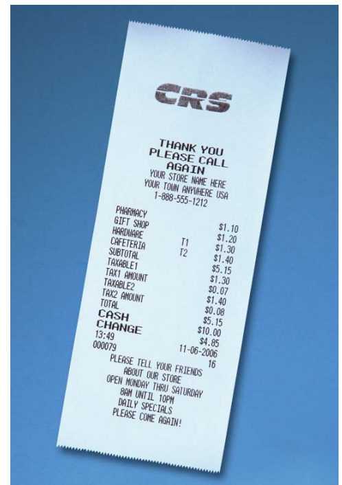
Thermal Receipt Shown 60% Actual Size