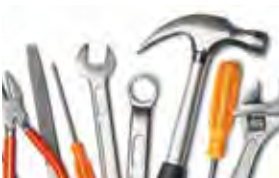
Hardware, Paint or General Retail Stores