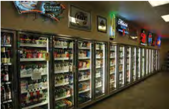
Beer / Liquor Stores