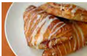
Dusty Environments Like Pizza and Bakeries