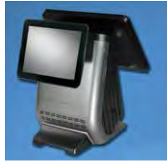
Optional Integrated 7" or 9.7" LCD Customer Display (NCC Reflection POS For Windows)