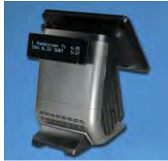
Optional Integrated VFD Customer Display