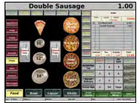
Graphic screens guide operators with minimal training.