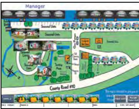
Customized graphical table maps.