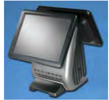
Optional Integrated 15" LCD Customer Display (NCC Reflection POS For Windows)