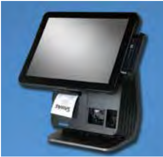
Standard Integrated Printer and Integrated Barcode Scanner Option