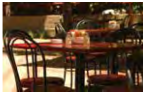
Food Concessions / Fast Casual Restaurants