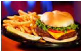
Cafeterias / Table Service / Quick Service