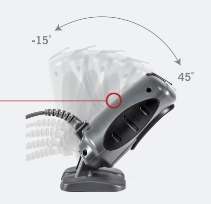
CR5000 Scan Radius