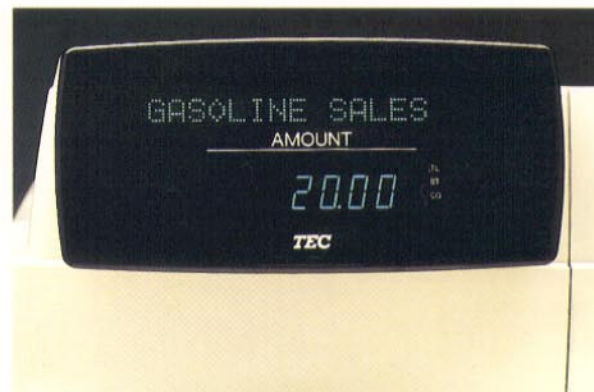
Two Line Customer Display