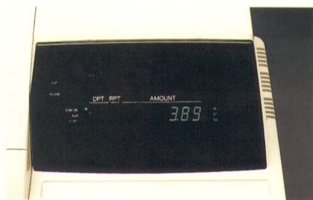
Single Line Operator Display

TEC America offers TECConnect™ and Simple Retailer™ Software packages to complement the MA-1650 system. These software packages provide a range of functions from basic communications, reporting and file maintenance via the TECConnect™ package to those features Plus full inventory, purchase order generation, accounts payable, accounts receivable, general ledger and other useful reports via the Simple Retailer™ package. By taking advantage of the MA-1650 and of these capable software packages, you can realize a total system that will be of tremendous help in managing your business.